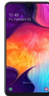
Samsung A50 33EUR

Ab. 6 EUR + Ab.10.1EUR + Ab. 10.1EUR + Ab. 18.5EUR = =