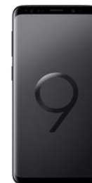
Samsung S9 64GB Dual SIM Lilac Purple