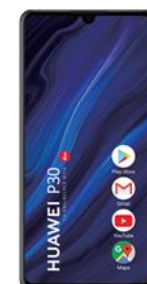
Huawei P30 128GB Dual SIM Black