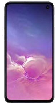
Samsung S10 E 128GB 55.46 EUR

Ab. 6 EUR + Ab.10.1EUR + Ab. 10.1EUR + Ab. 18.5EUR = =