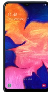
Samsung Galaxy A10 0 EUR