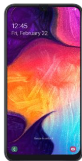
Samsung A50 0 EUR