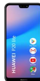
Huawei P20 LITE