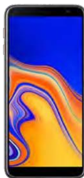
LG K9 16GB 0 EUR