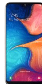
Samsung Galaxy A20e 32GB Dual SIM Black