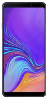
Samsung A50 0 EUR