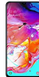
Samsung A 70 128GB Dual SIM Black