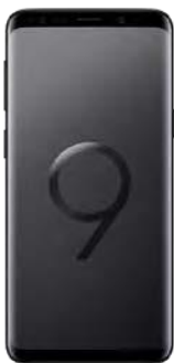
Samsung A70 128 GB 0 EUR