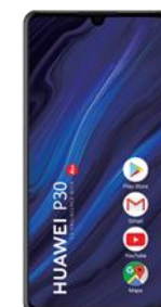
Huawei P30 128GB Dual SIM Black