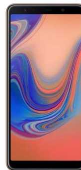
Samsung A20e 32 GB 0 EUR

Ab. 6 EUR + Ab.10.1EUR + Ab. 10.1EUR + Ab. 18.5EUR =