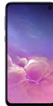
Samsung S10 E 128GB 55.46 EUR

Ab. 6 EUR + Ab.10.1EUR + Ab. 10.1EUR + Ab. 18.5EUR =