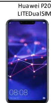
Huawei P20 LITE DualSIM