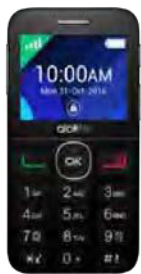
15.13 EUR Alcatel 2008 Senior

Telefoane in limita stocului. Traficul internet ce poate fi consumat in roaming SEE se calculeaza dupa formula reglementata UE.