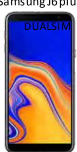
Samsung J6 plus