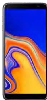
Samsung Galaxy J6 Plus 0 EUR