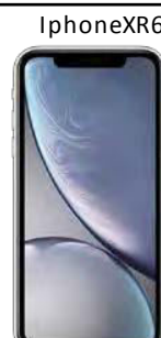
Iphone XR 64GB