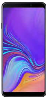
Samsung A50 0 EUR