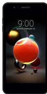
36.13 EUR LG K9