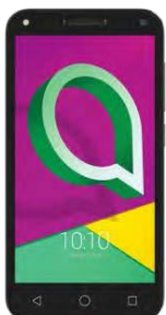
9.24 EUR Alcatel U5 8GB DualSIM