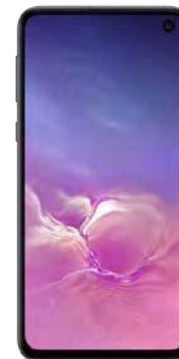
Samsung S10 E 128GB 186.55 EUR

Ab.10.1EUR + Ab.10.1EUR + Ab. 10.1 EUR + Ab. 10.1 EUR =