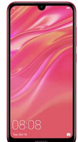
29.41 EUR Huawei Y7 DualSIM 2019